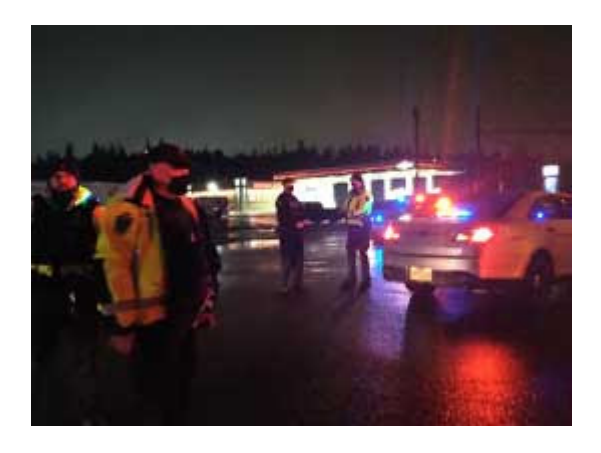
Watch as striking Dominion workers were threatened with criminal charges as the Royal Newfoundland Constabulary surrounded a peaceful secondary picket line with tactical and riot squads.